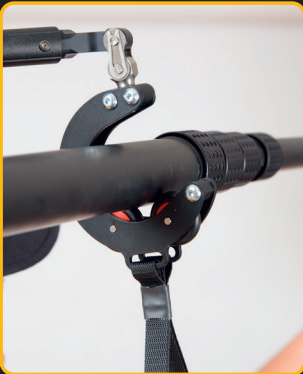
Boom Hook with rollers