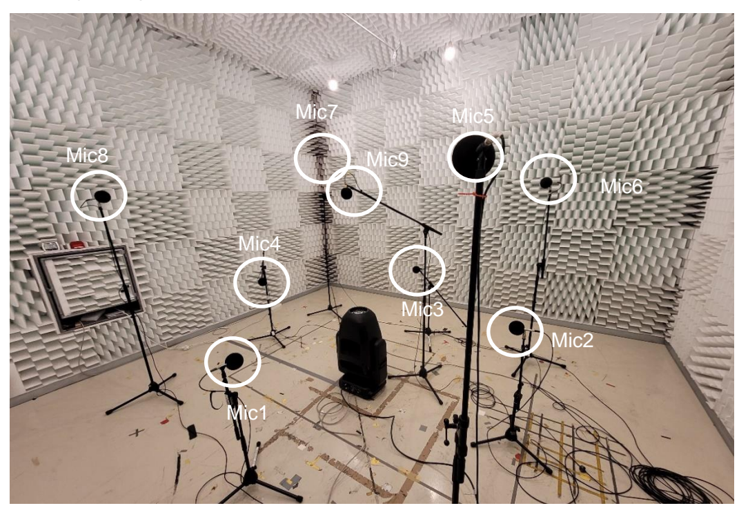
Figure 1. Semi-anechoic measurement room, the device under test and the microphone positions.

The measurements were carried out in a semi-anechoic room at Müller-BBM Industry Solutions GmbH. The room has a very low background noise of about 1 dB(A). The device was placed on the floor in the center of the room. A total of 9 microphones were installed at a 1 m distance to the device on a cuboid surface. Figure 1 shows the semi-anechoic measurement room, the device under test (Halcyon Silent) and the 9 microphone positions.