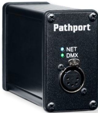
Model shown: PWPP DT P1 XLR5F