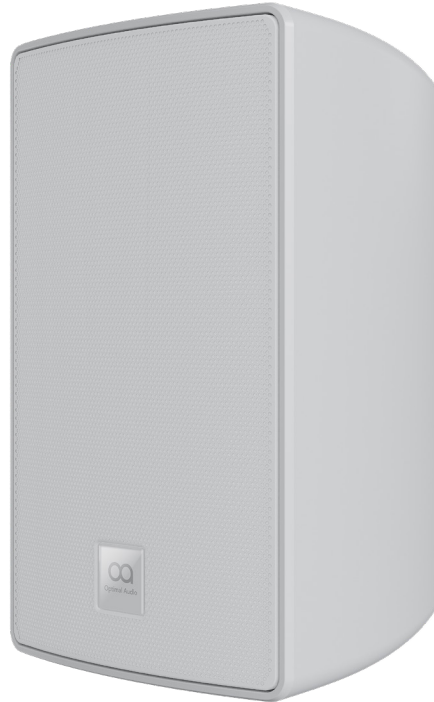
Product shown with terminal cover accessory – sold separately.